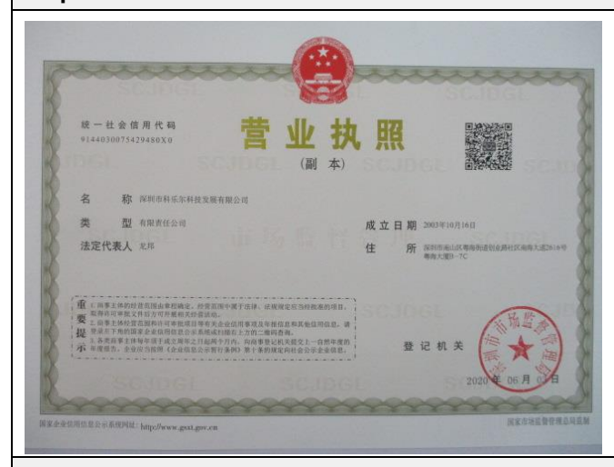
Certification & Photos -- Import And Export Registration

Certification & Photos -- Business License (Duplicate) with Certificate / Records of Annual Inspection